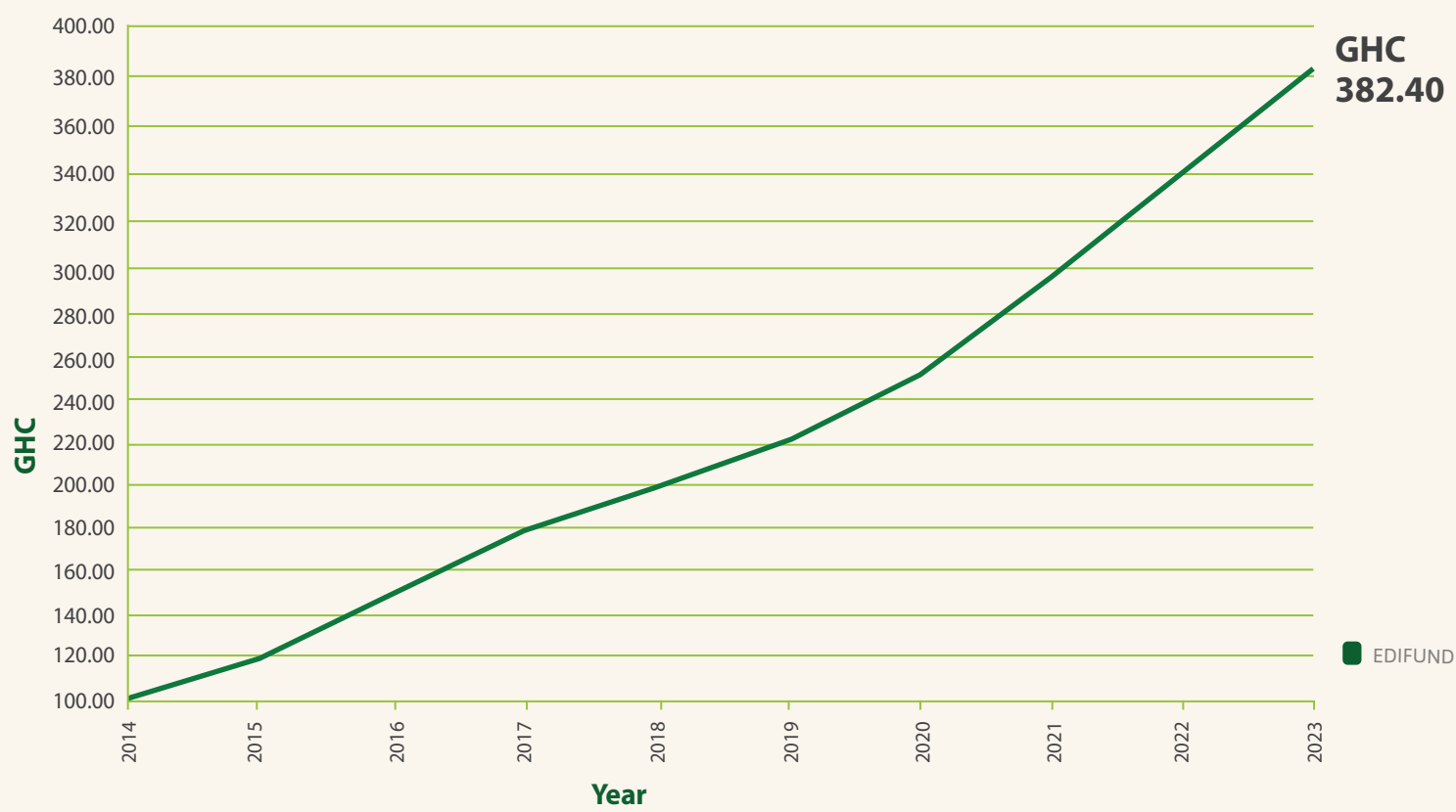
Compounded Annual Growth 1 (As at April 30, 2023)