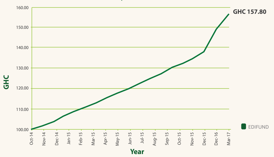
Tier 1: Growth of GHC 100 (From inception to March 31, 2017)

#Risk/Return profile measures the degree of uncertainty that an #Risk/Return profile measures the degree of uncertainty that an investor can handle regarding fluctuations in the value of their portfolio. The amount of risk associated with any particular investment depends largely on your personal circumstances including your time horizon, liquidity needs, portfolio size, income, investment knowledge and attitude towards price fluctuations. Investors should consult their financial investment advisor before making a decision as to whether this fund is a suitable investment