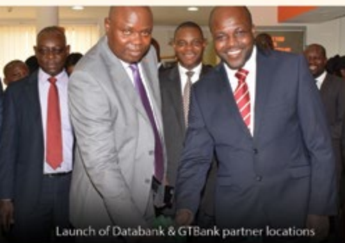
Launch of Databank & GTBank partner locations