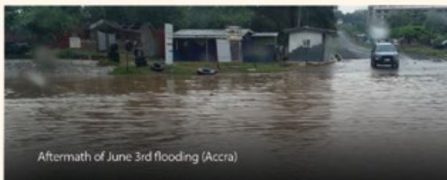
Aftermath of June 3rd flooding (Accra)