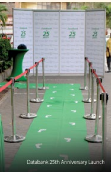
Databank 25th Anniversary Launch