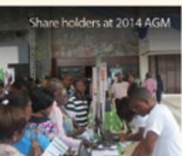
Share holders at 2014 AGM

The year 2015 had its ups and downs. However, in the midst of it all, we have found a lot to be thankful for and we say "To God be the Glory." Here are some photos highlighting a number of memorable events from 2015.