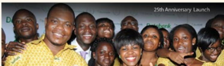
25th Anniversary Launch