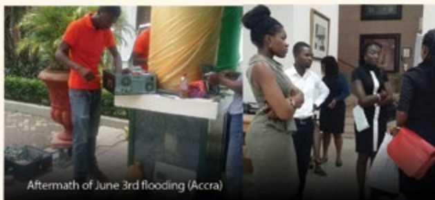
Aftermath of June 3rd flooding (Accra)