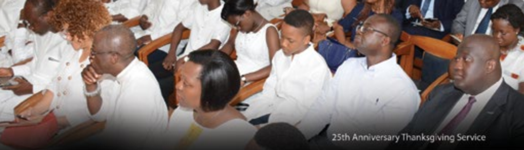
25th Anniversary Thanksgiving Service