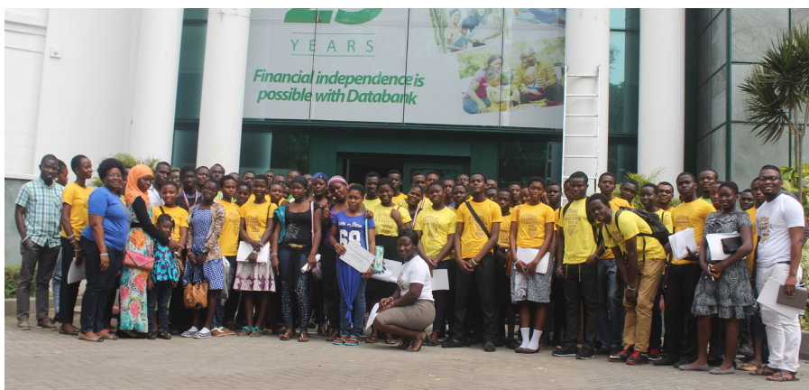
Participants: Young Leaders Mentorship Program 2016

The Foundation's initiative to inculcate the skill of leadership in young Ghanaians continues to bring out Databank's values of leadership, excellence, humility and integrity. Indeed, leadership is the capacity to translate our vision into reality.